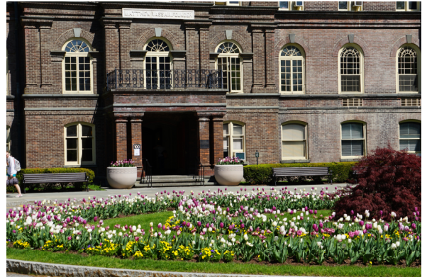
Vassar College – host of the 2019 HRES Symposium